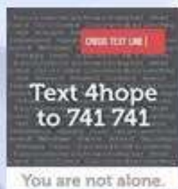
Crisis Text Line

Having a bad day? There's an app for that!