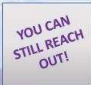
School Counselors & Prevention Educators